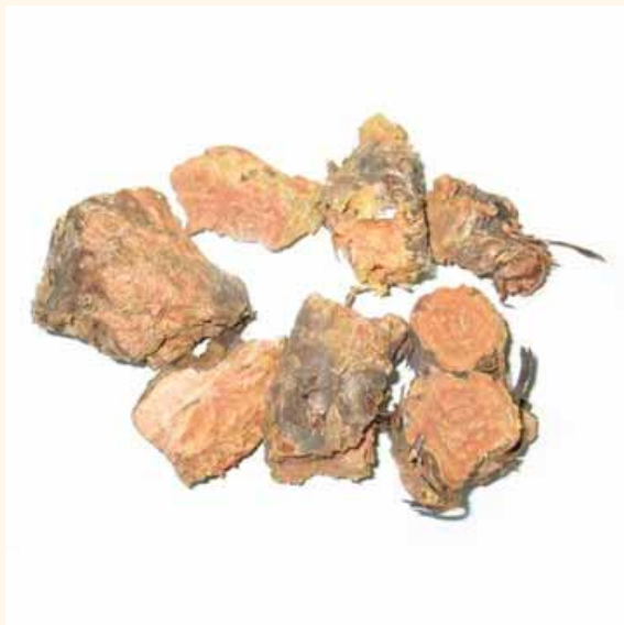
Rhodiola rosea Golden Colored Roots