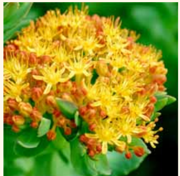
Yellow Blossoms of Rhodiola rosea