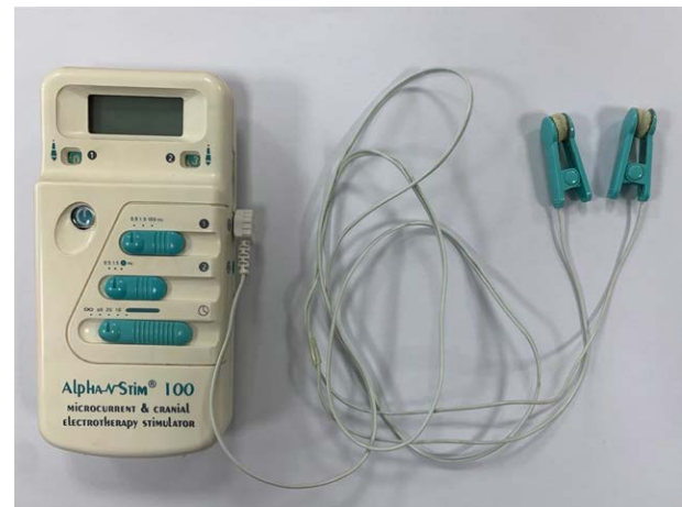
Figure 2. Cranial electrotherapy stimulation unit. The Alpha-Stim 100 (Electromedical Products International Inc, Mineral Wells, TX) cranial electrotherapy stimulation unit was used in the study.