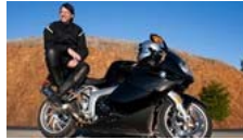
Tough Exercise to Look Tough on a Bike