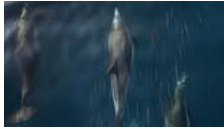
Counting the Whales, Passing the Time