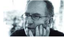
How the Global Credit Crunch Inspired a Novel