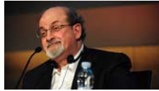
Rushdie's Video Address to Jaipur Canceled